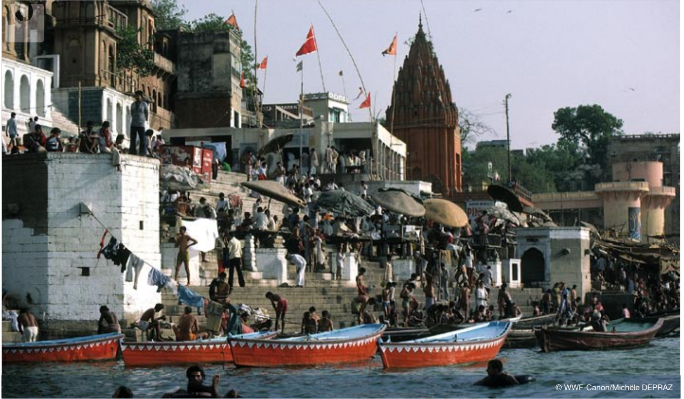
Typical daily scene along the Ganges River, people bathing and performing their ritual ablutions. Varanasi, India.

In 1996, a 30-year Ganges Water Sharing Treaty was finally agreed between India and Bangladesh (Transboundary Freshwater Dispute Database 2002). Its ineffectiveness however is evident, as India progresses with its river linking project (Indian Council of Forestry Research & Education 2003).