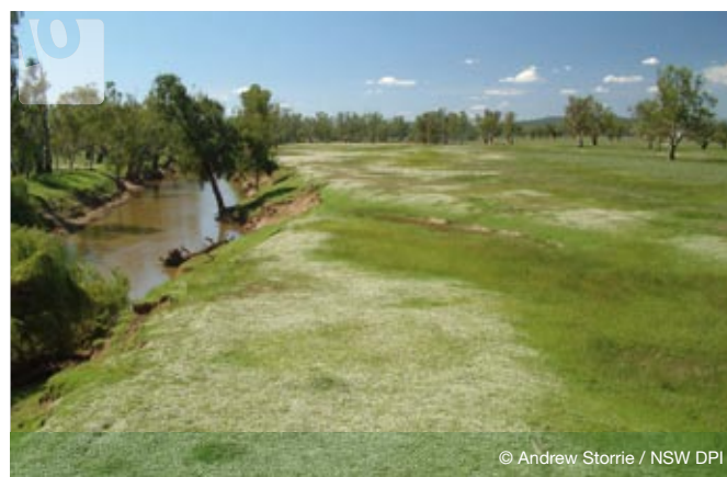
Flowering Lippia infestation along banks of Namoi River, near Boggabri, NSW, February 2004.