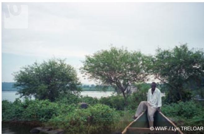
The Lake Victoria source of the Nile. The river originates from two distinct geographical zones, the basins of the White and Blue Niles.

In the Mara river watershed in Kenya and Tanzania, which drains into Lake Victoria, WWF is facilitating stakeholder dialogue on integrated river basin management for regional and district government institutions, non-governmental organizations and communities. This includes work to: protect the forest sources of the river on the Mau escarpment, model environmental flows, and develop water sharing agreements needed to sustain people and nature along the river.