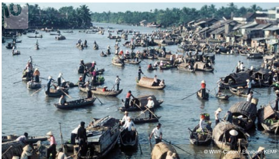
Sampans meet at early morning market in the Mekong delta. Vietnam.

In 1995, all basin countries except the two upper basin states, China and Myanmar, signed the Mekong Agreement and revitalized the Mekong River Commission 66 to promote cooperative management of the river (Water Policy International Limited 2001). Though the Commission has made progress in its relations with China and Myanmar in sharing information on fisheries and hydrological data, insufficient attention has been paid to halting overfishing throughout the basin. Areas threatened by overfishing need better institutional capacity to create and enforce legislation on fishing methods and rights. In addition, community-based fishing cooperatives, improved communication between stakeholders and integrated basin management are essential in protecting beneficial flooding and the Mekong River's resources.