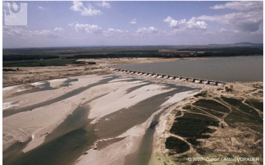
Dam on the Danube River.

In 2000 WWF facilitated a heads of state summit of basin governments. They pledged to protect and restore 600,000 ha to establish a 'Lower Danube Green Corridor' of restored riparian lands for nature conservation, water quality improvement, better flood management, and development of sustainable livelihoods for local people. Progress in implementing this commitment has been slow. It is likely, however, that had the pledged restoration been implemented, the floodplains would have mitigated the 2006 lower Danube floods by holding and safely releasing the water. In 2003, WWF completed the official 'Danube River Basin Public Participation Strategy', to contribute towards the implementation of the EU Water Framework Directive in the basin (Jones et al. 2003).