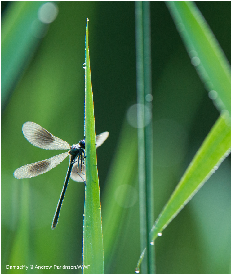
Damselfly