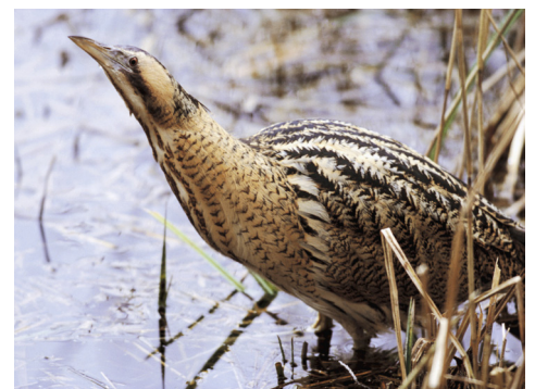
Bittern

In East Anglia, The Rivers Trust and Norfolk Rivers Trust are working together with partners in the Cam & Ely Ouse and Broadland Catchment Partnerships to tackle some of these threats affecting rivers across the region. The project, which runs until June 2018, is providing support to farmers and land managers to implement changes in land management that help to enhance soil quality to improve water efficiency, increase yields, and reduce both the likelihood and impacts of run-off pollution. The project aims to directly improve river health, but to also help provide a long lasting partnership approach for delivering water sensitive farming and promoting the positive role that businesses have to play in improving the water environment.