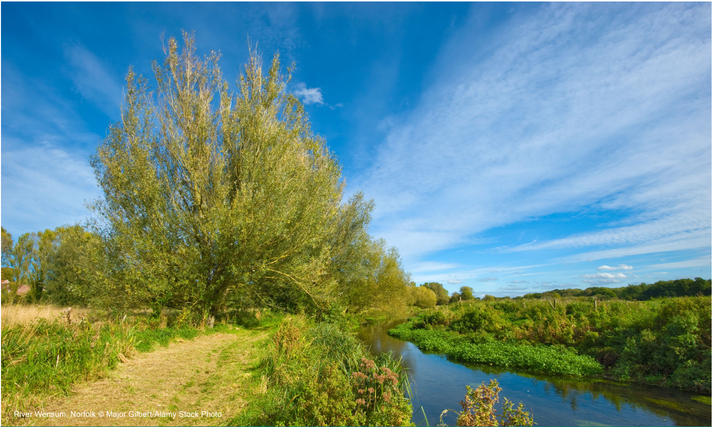
River Wensum, Norfolk