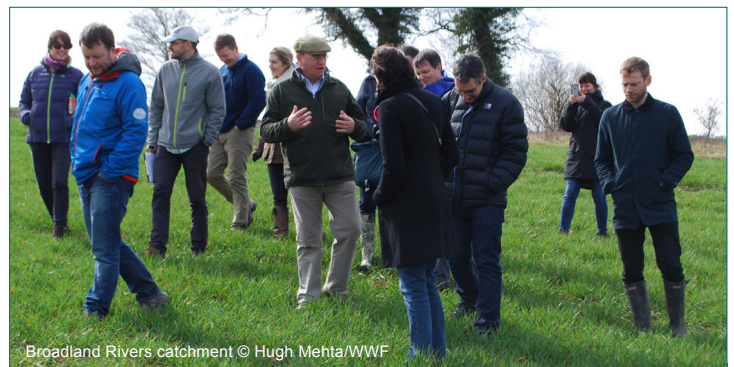
Broadland Rivers catchment

This work is part of the WaterLIFE project, an EC LIFE+ funded project led by WWF-UK, which aims to work with communities, business and government to improve the health of the freshwater environment. For more information, visit: www.waterlife.org.uk