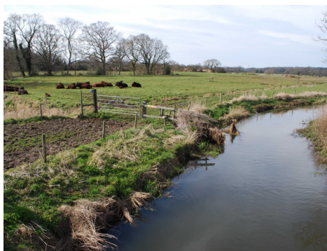
River Bure