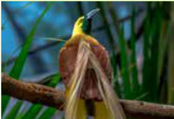
Bird of paradise

Which of these animals is captured for its scent gland to make perfume and traditional medicine?