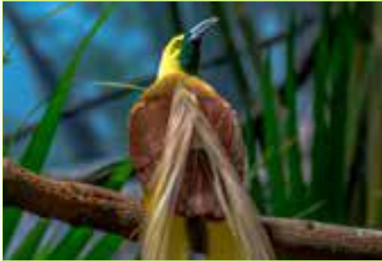
Bird of paradise

Which of these animals is captured for its scent gland to make perfume and traditional medicine?