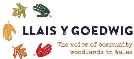
33. Llais y Goedwig