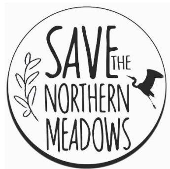
38. Save the Northern Meadows