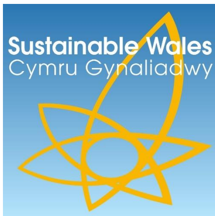
34. Sustainable Wales