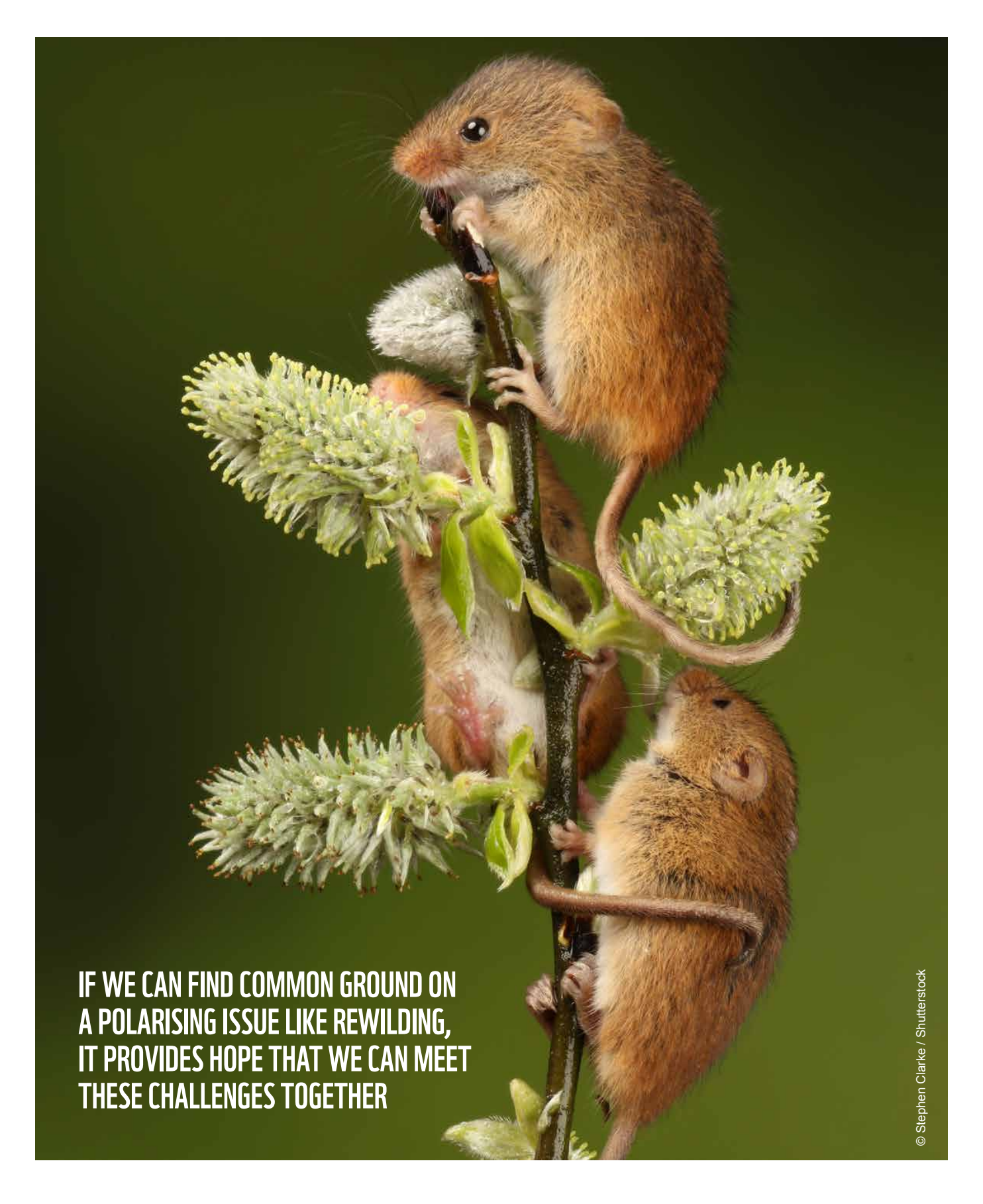
Indeed, for all our sakes, it is essential.

WWF-UK would like to thank the farmers who took part in this research. We commit to integrating their views into how we approach the issue of rewilding, as outlined in these recommendations. We genuinely believe there is significant opportunity to work together with farmers on tackling the nature and climate crises while meeting the needs of people.