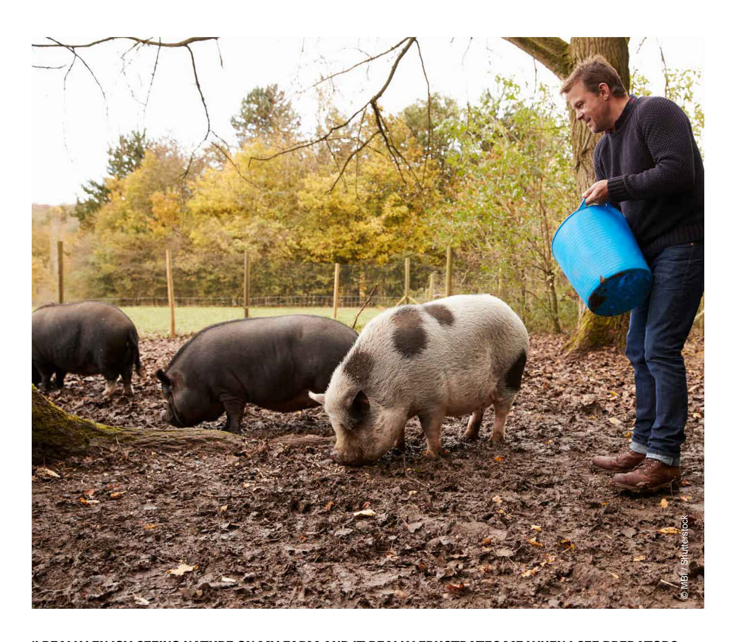
'I REALLY ENJOY SEEING NATURE ON MY FARM AND IT REALLY FRUSTRATES ME WHEN I SEE PREDATORS GROWING TO THE LEVEL WHERE THIS IS NEAR DISAPPEARING' (SHROPSHIRE)