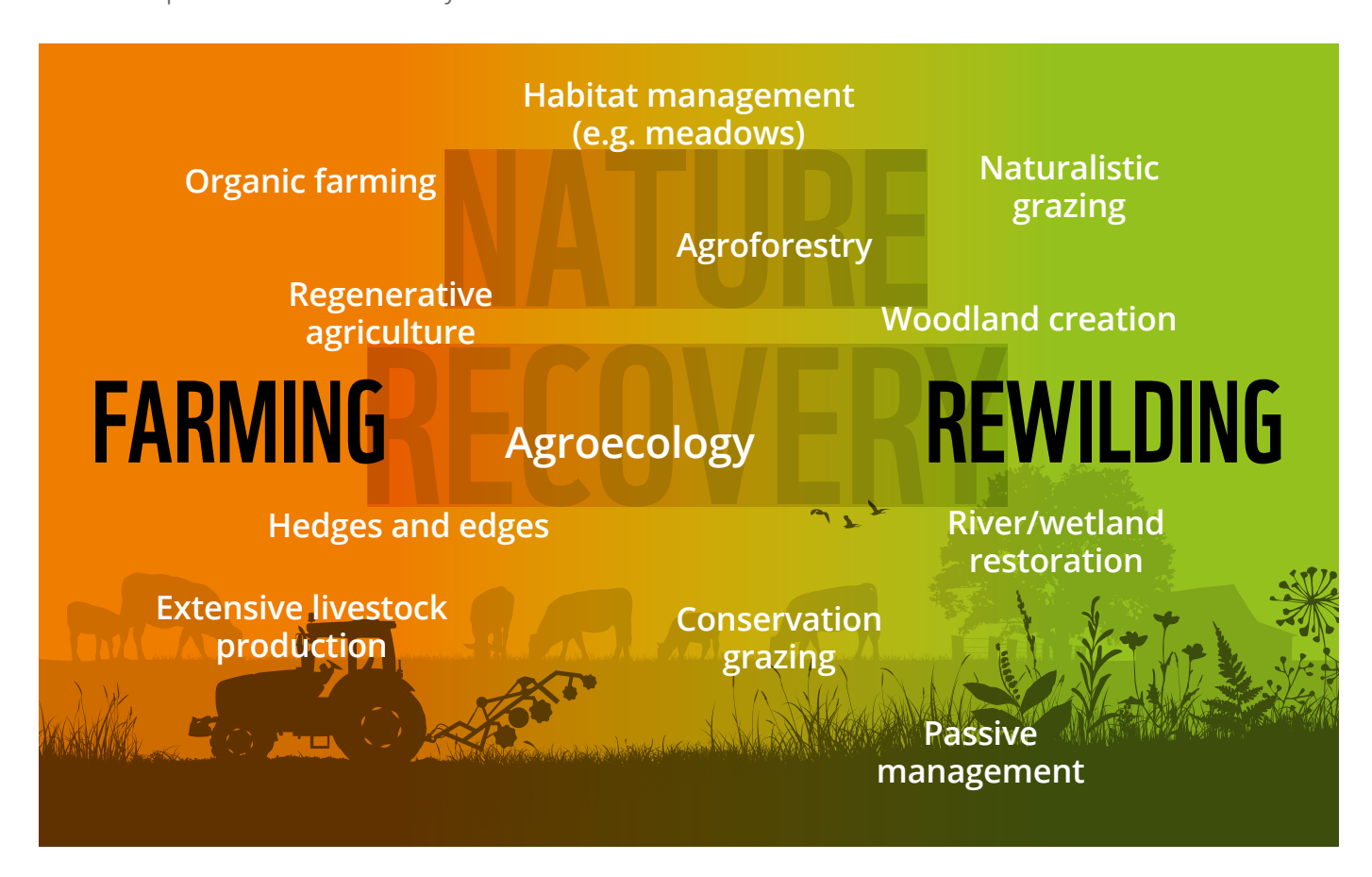
Figure 1, above, depicts the spectrum of nature recovery. It does not capture the full range and complexity of different approaches, but does illustrate how rewilding, conservation and farming overlap in significant ways. All are part of, and reliant on nature, without clear boundaries between them.