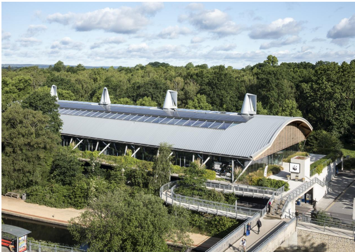
The Living Planet Centre